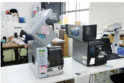
Label printers located in Lush Japan office